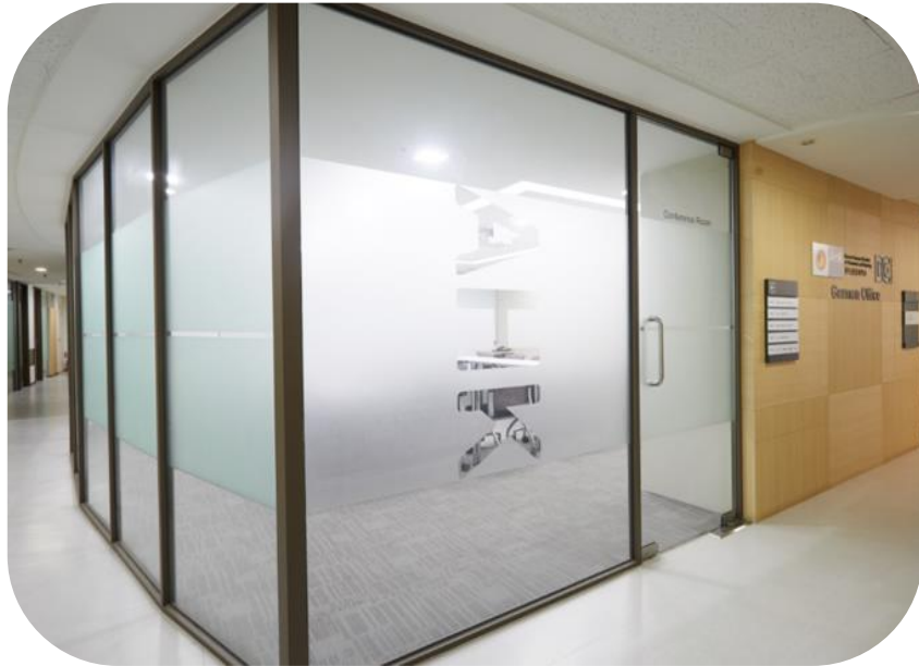
German Office Meeting Room